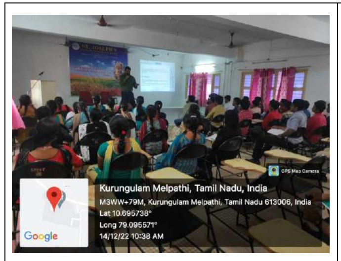
Introductory talk by Resource person