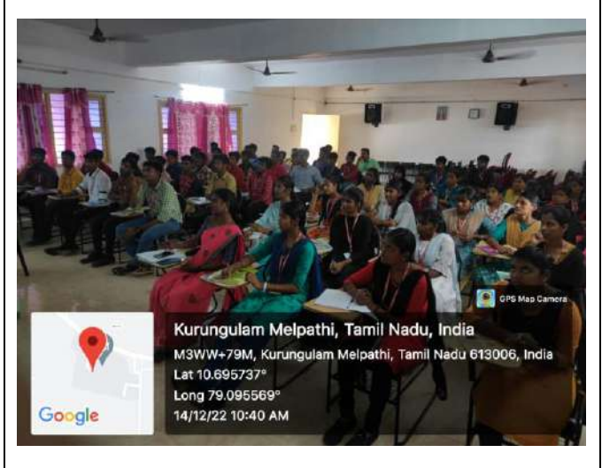
Participants of the audience